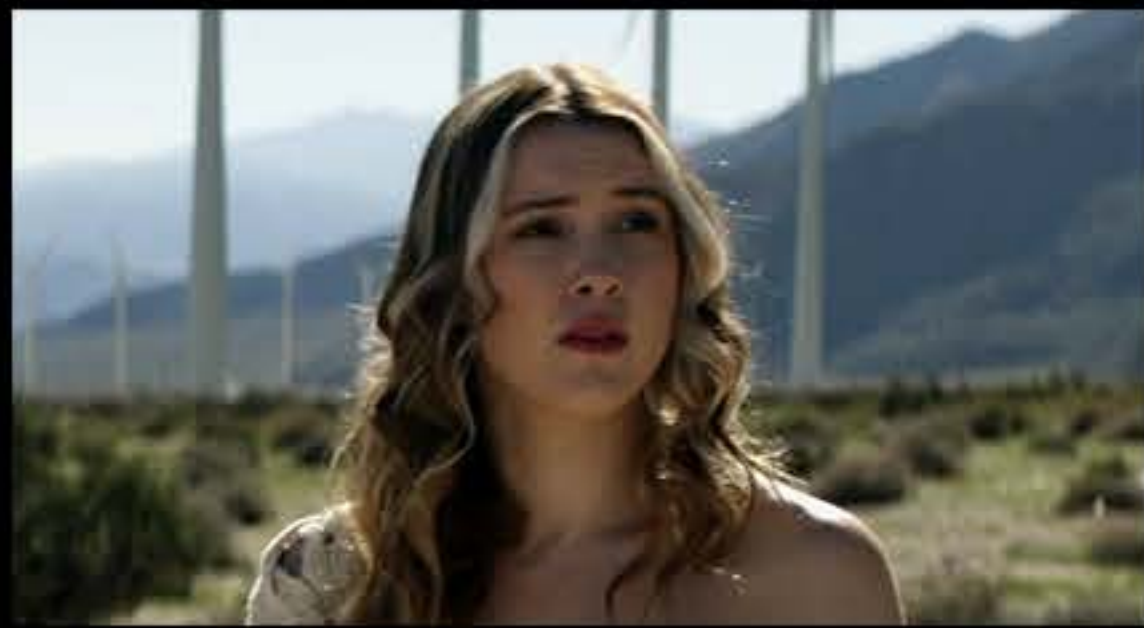
Beautiful Skin Tones

Cinematic bokeh with high contrast and nice focus fall-off