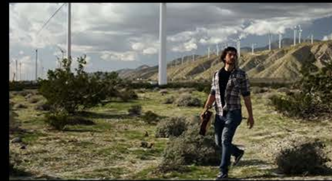
Large Image Field

Low distortion for uncompromised anamorphic capture