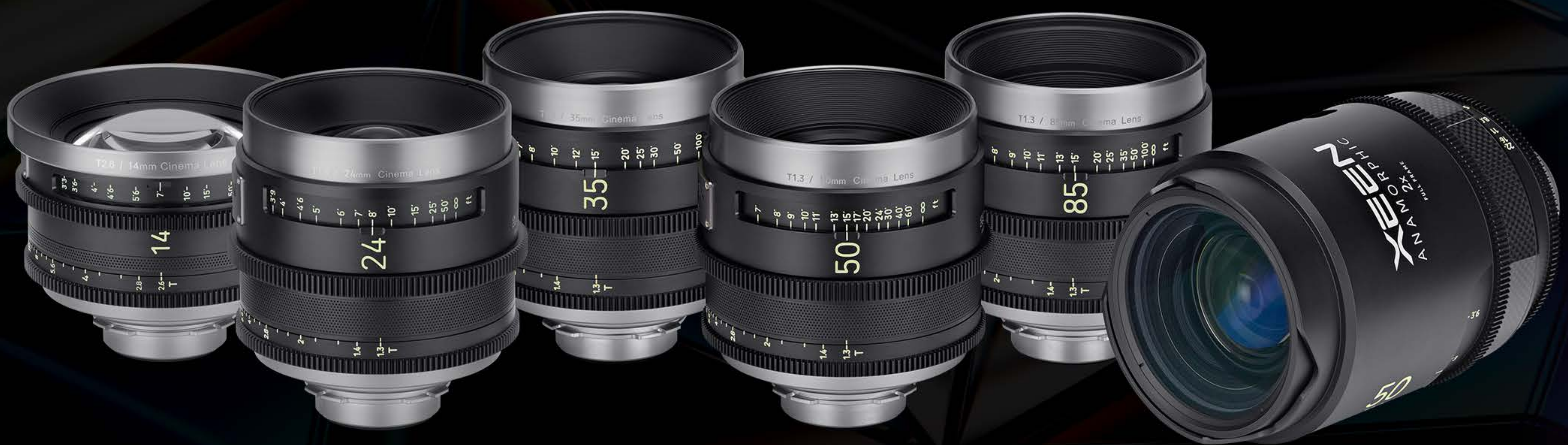
Meister 14mm T2.6